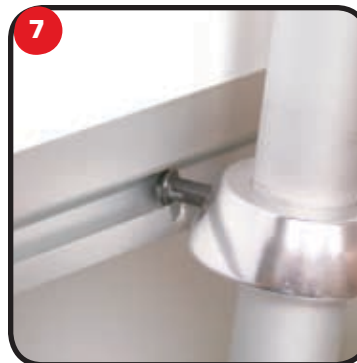
7 Attach bottom graphic rail to bottom rail fitting.