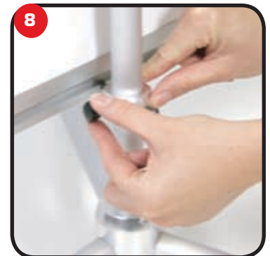
8 Put tension on graphic and tighten screw on bottom rail fitting.