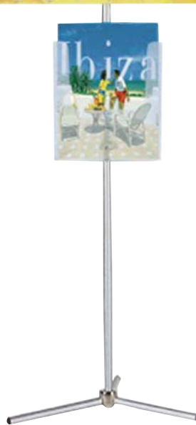
Sprint, with Graphic and Literature Holder