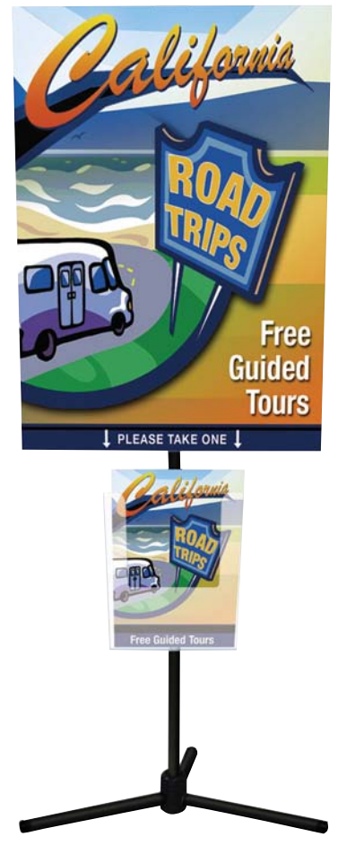
Summit with Combination Graphic and Literature Holder