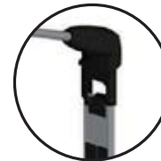
Slide-on channel bar mounted lights